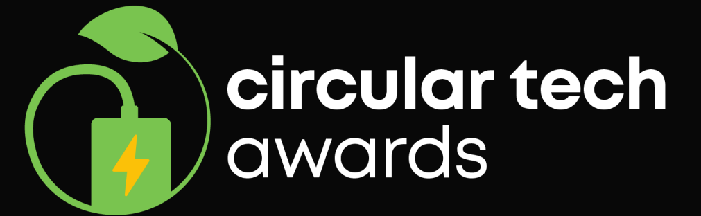
Main Logo Variation