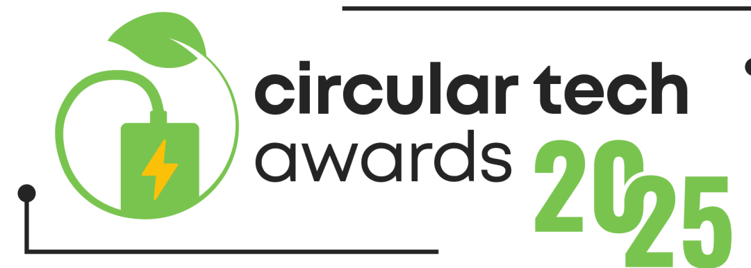
Logo Variation Alternate